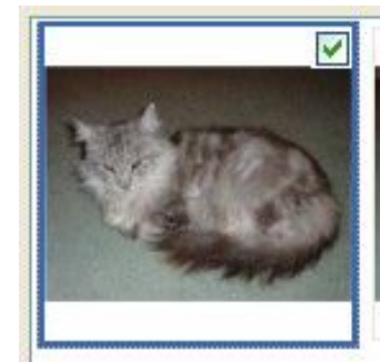
(This is a picture of Sylvester my Maine Coon cat)

You may select the picture individually ( the best option if you have lots ) by clicking in each box next to the picture. A green tick will be displayed.